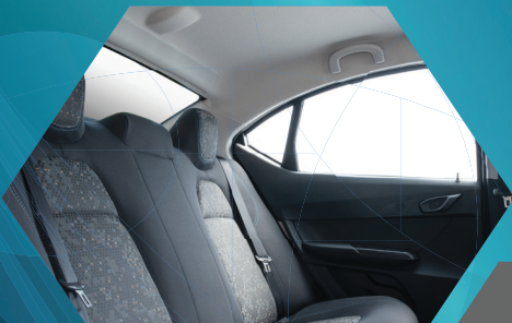
Premium fabric seats