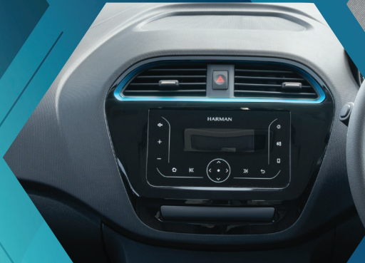
Impressive sound experience by Harman™**