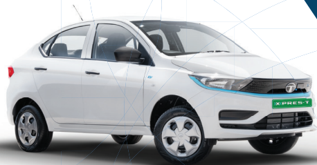
Breakfree coupe-inspired roof line