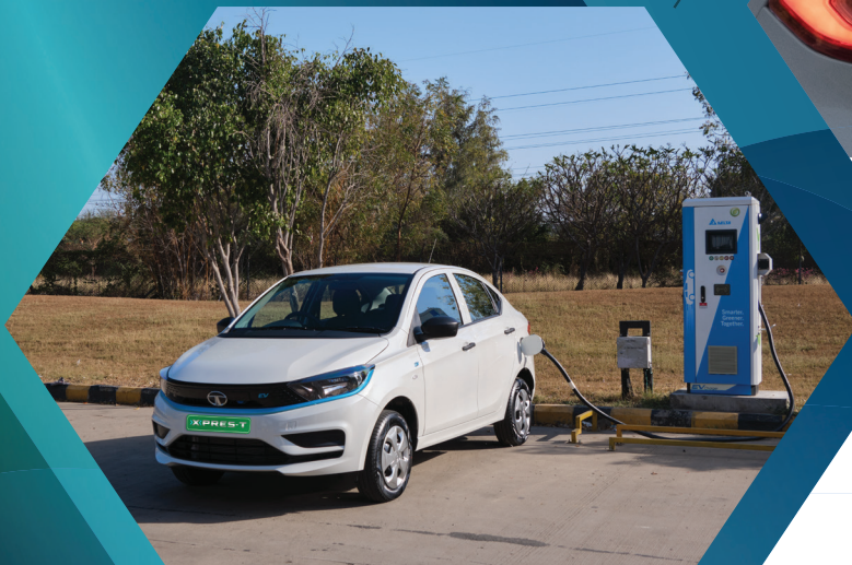
Fast charging 0 to 80% in 1 hr 50 min*