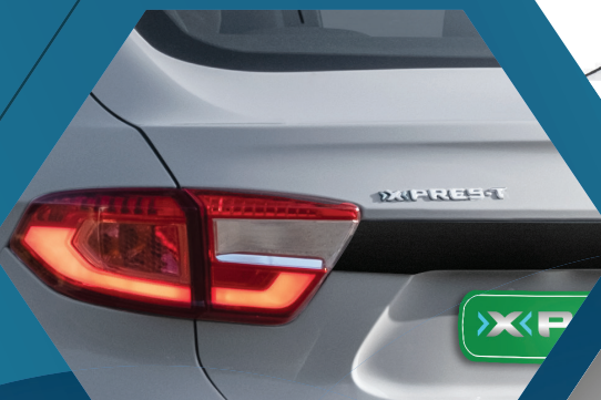
Crystal-inspired LED tail lamp