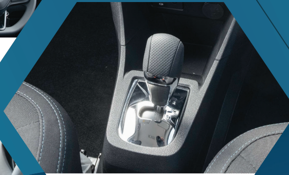
Single speed transmission with sport mode, drives like automatic