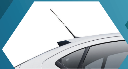
LED high mounted stop lamp