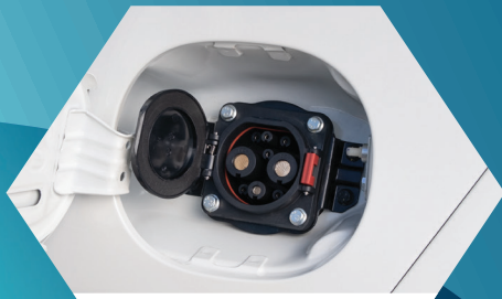
Fast charging socket