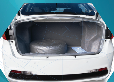
255L boot space