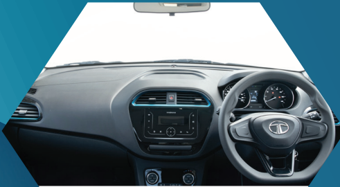
Premium black interior theme with automatic climate control