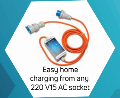
Easy home charging from any 220 V15 AC socket