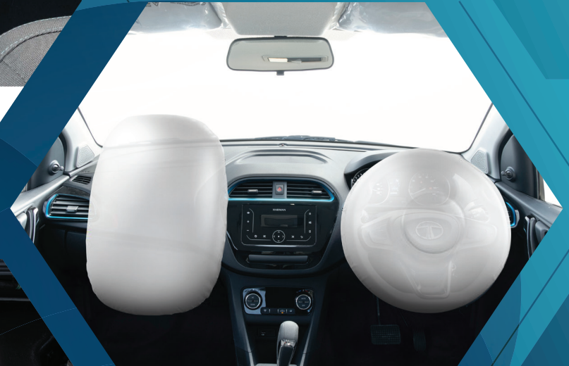
Enhanced safety with dual front airbags