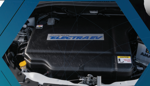
High energy density 21.5 kWh battery for greater driving range on a single charge