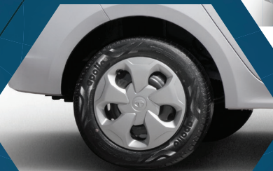
Stylish wheel rims & Stylish alloy wheel (Available in XT+ only)