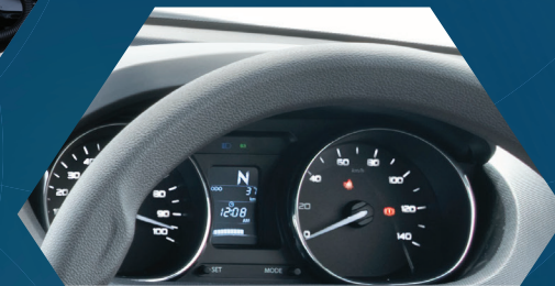
Chrome ringed instrument cluster with high-resolution, segmented driver information system