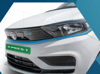
EV accent themed grille